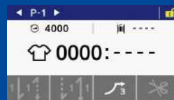
Easy home screen