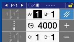
Quick home screen