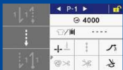
Detailed home screen

There are three types of operator panel display. All the detailed home screen, quick home screen and easy home screen are easy to use without concern for panel operation.